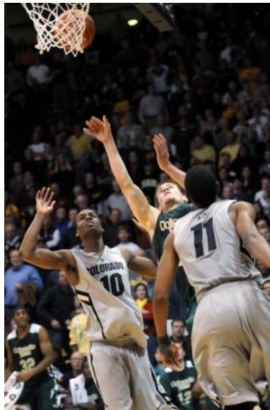
KELLY KEEN | COLLEGIAN

The Buffs went to the free throw line more than twice as many times as the Rams did with a shocking 41-19